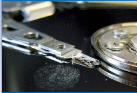
Forensic analysis of data carriers