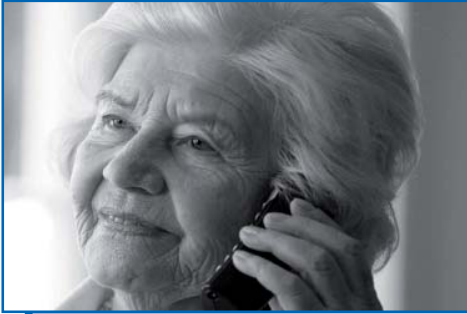
German Federal Criminal Police Office Project Group "Call Centre Fraud"