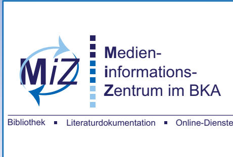
German Federal Criminal Police Office Literature Documentation