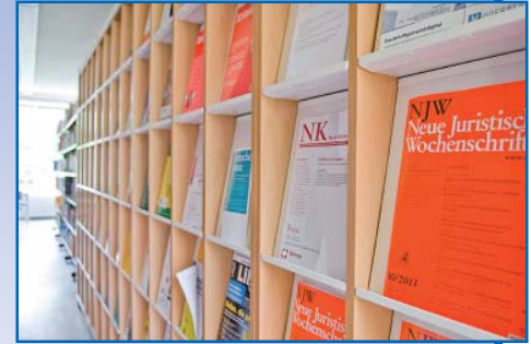
German Federal Criminal Police Office Library